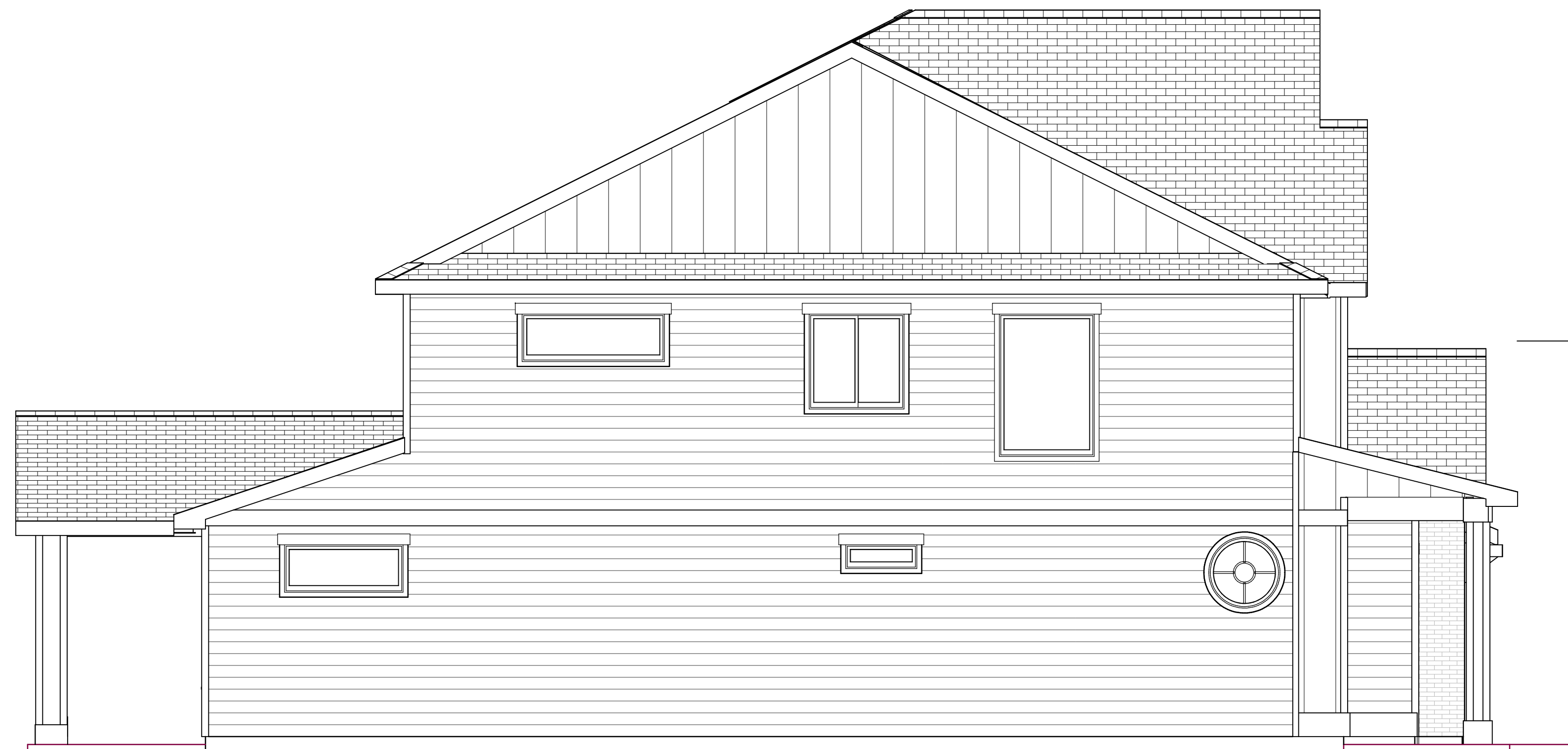
LEFT ELEVATION 1/4"=1'-0"