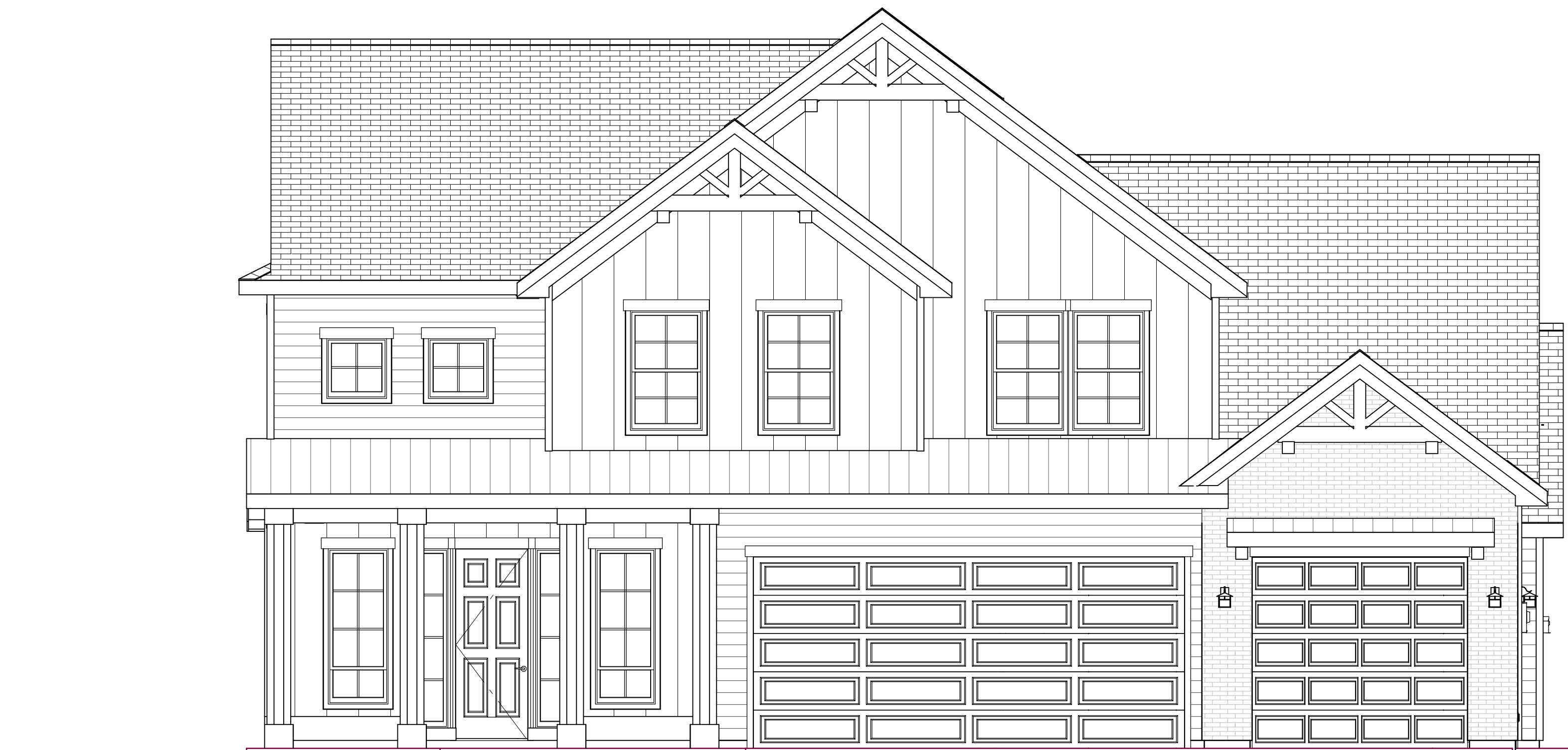
FRONT ELEVATION 1/4"=1'-0"