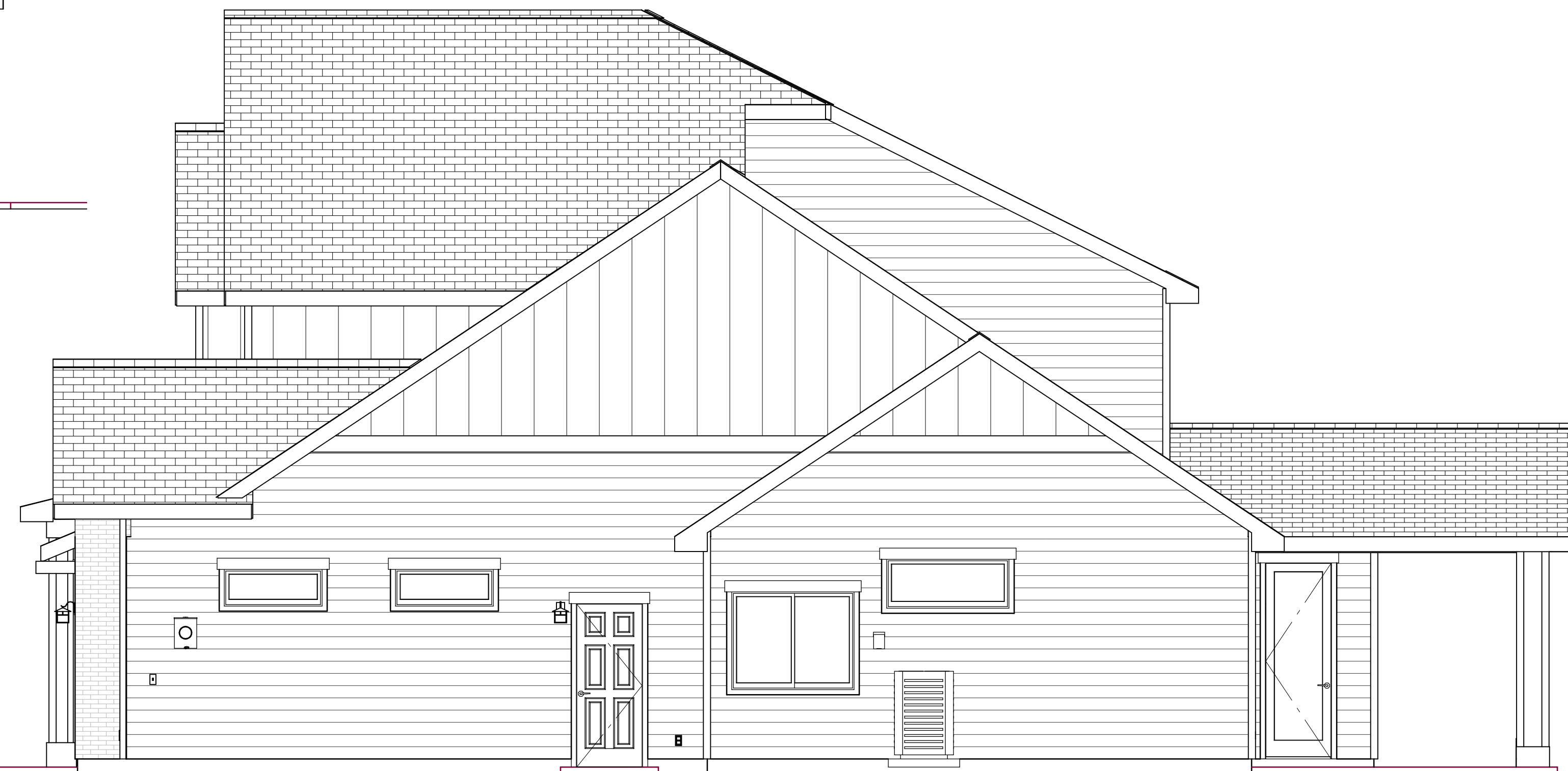
RIGHT ELEVATION 1/4"=1'-0"