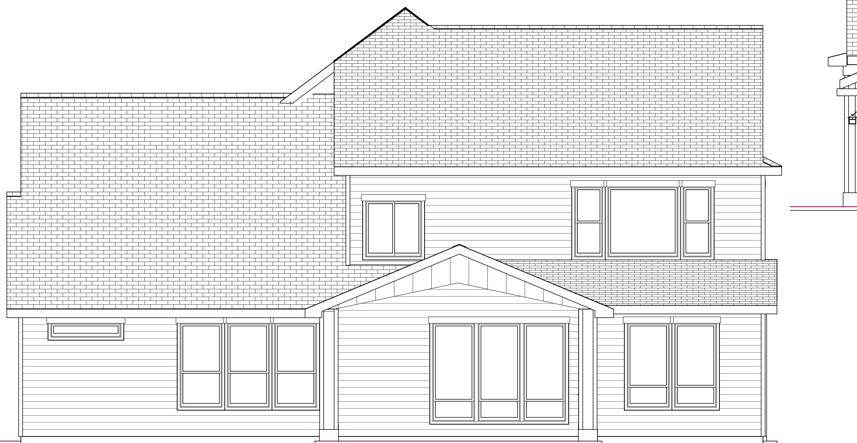
REAR ELEVATION 1/4"=1'-0"